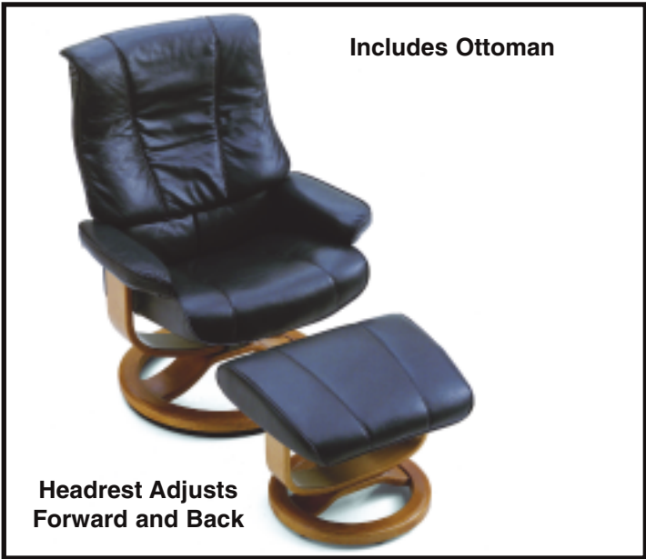
GARBO Swivel Recliner 32"W x 41"H x 30"D Ships Via Fed Ex Ground