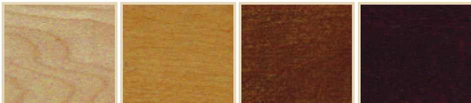
Maple Stain Oak Stain Walnut Stain Espresso Stain