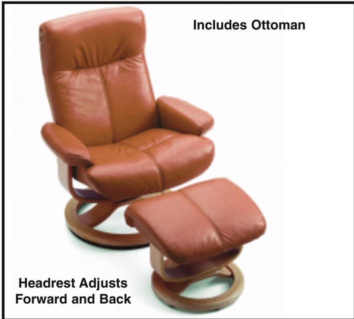
SWAIN Swivel Recliner 32"W x 41"H x 30"D Ships Via Fed Ex Ground