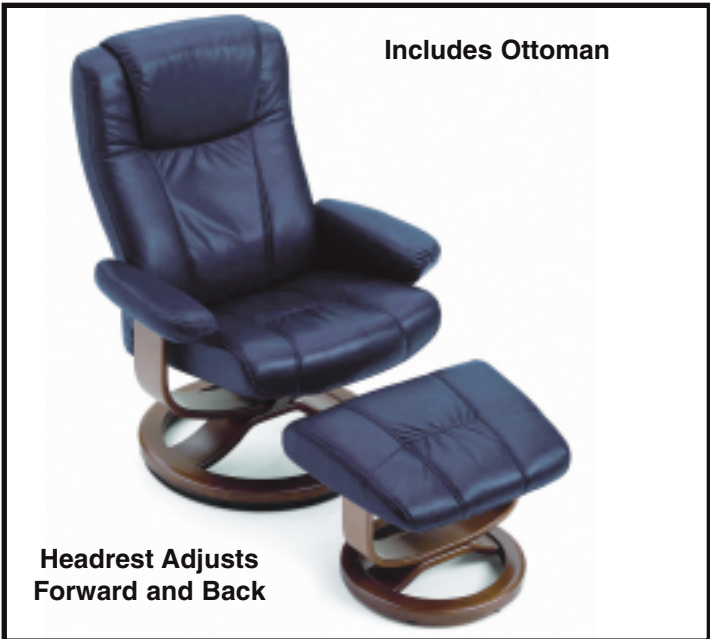
Myers Swivel Recliner 32"W x 41"H x 30"D Ships Via Fed Ex Ground