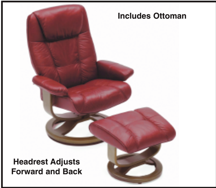
ARLEN Swivel Recliner 32"W x 41"H x 30"D Ships Via Fed Ex Ground