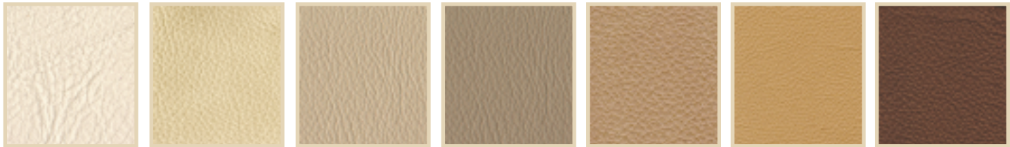
Moon Meringue Cappucino Mushroom Wheat Champagne Brown